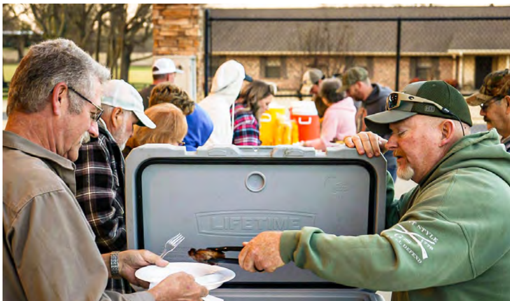
Earlier this spring, Central Church-Tipton, and volunteers from Beaver Baptist Church and Munford Baptist Church came together to make the First Annual Wildlife Feast at the TBCH a fun and delicious event.