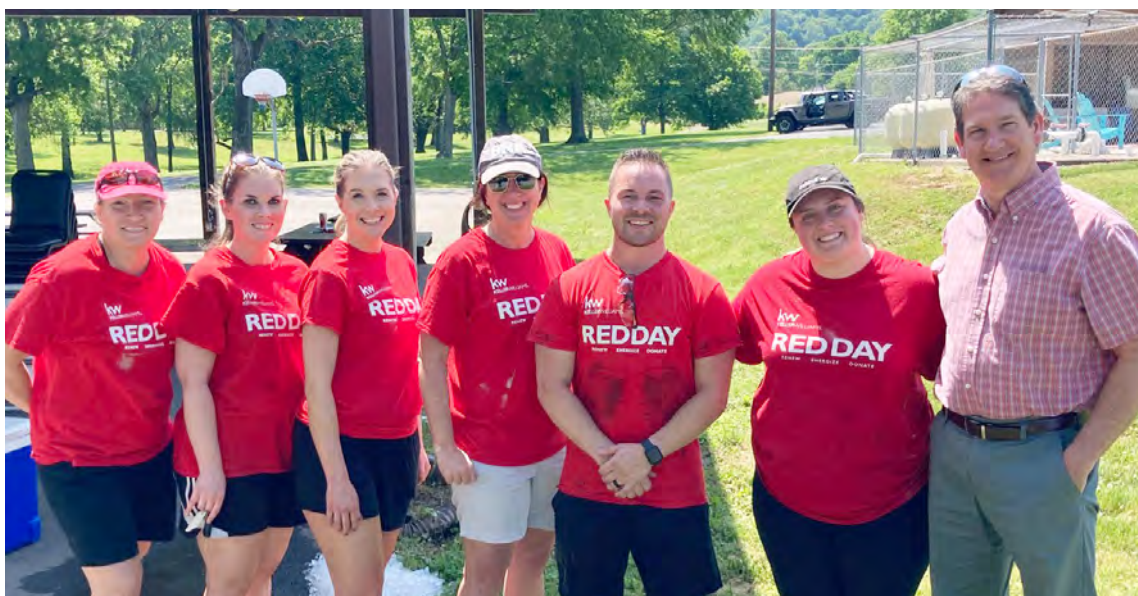
Plenty of extra hands from Keller Williams showed up for their annual Red Day volunteer service event. These helpful folks tackled work projects all over our Brentwood Campus.