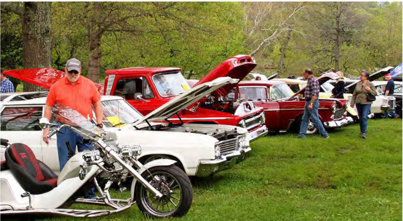
More than 130 classic cars, trucks and motorcycles lined up at our Brentwood Campus for the 22nd Annual Kars4Kids car show. Presented by Music City Antique Automobile Club of America, this event raises money and friends for TBCH.