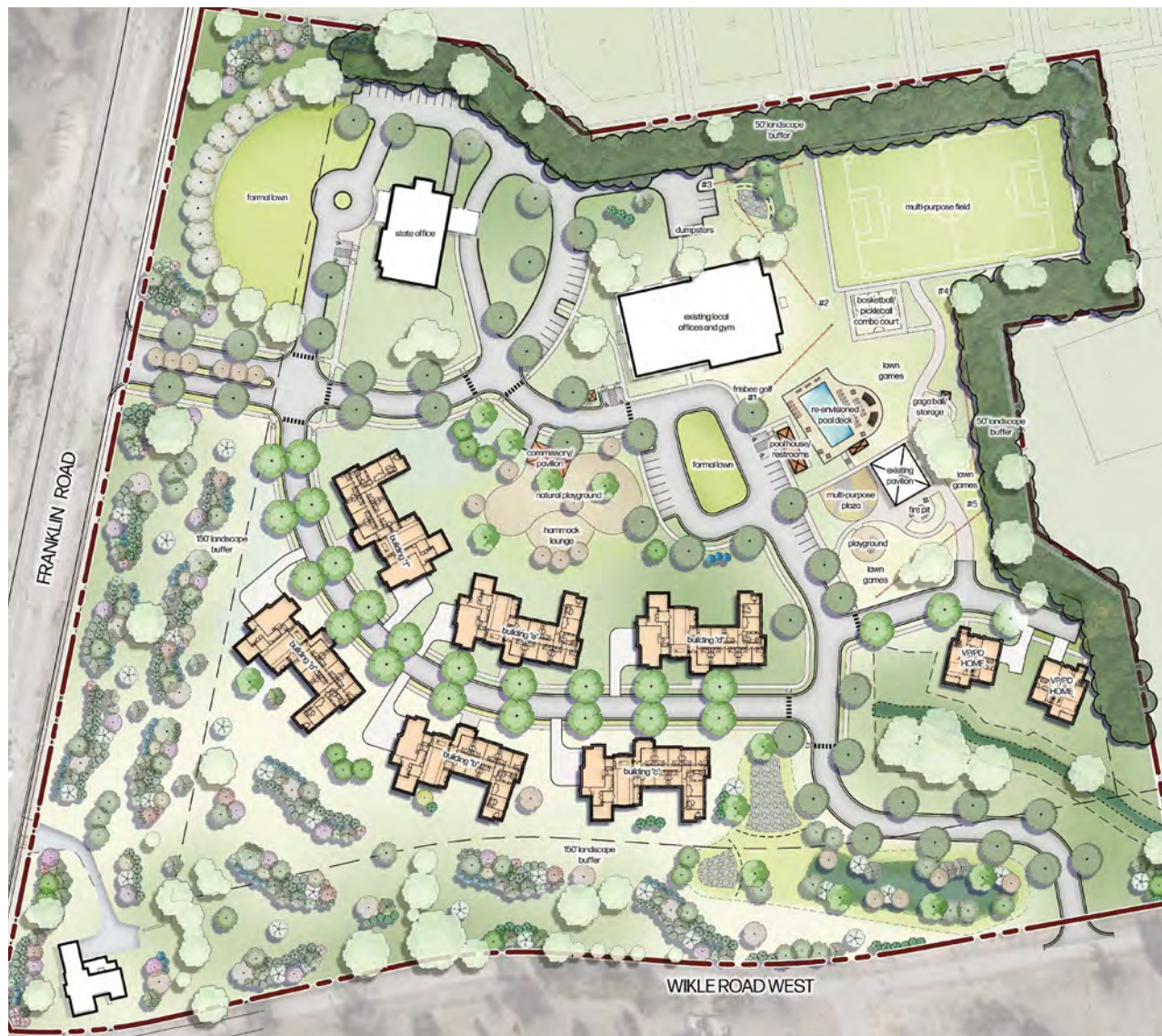
Proposed plan for the transitions at our Brentwood Campus

Residential Care: Christian houseparents serving in family-style homes on three campuses across the state, providing safety and biblical guidance so children can thrive.