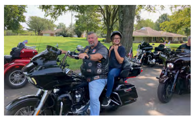
And in Your majesty ride on victoriously, for the cause of truth, humility, and righteousness... (Psalm 45:4a)