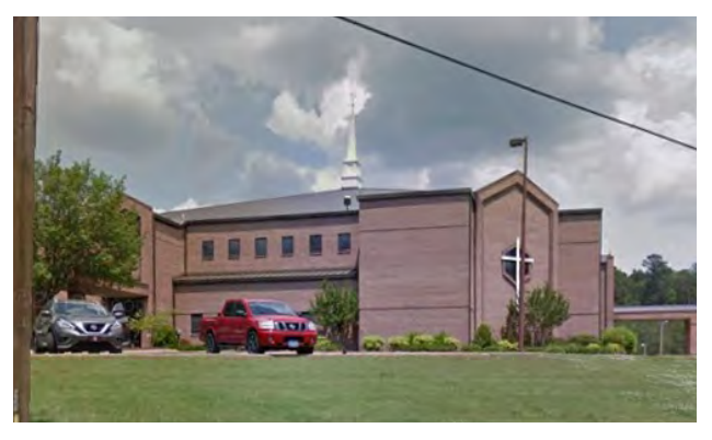
Lakeview BC in Selmer

First Baptist Church in Collierville has also supported TBCH Foster Care throughout the past several years, and recently were quick to spring into action when they heard that we needed space for two case managers in the Memphis area, even supplying volunteers to assemble office furniture! TN-KEY classes for foster parents will be hosted there in the Spring, making the location even more of a blessing.