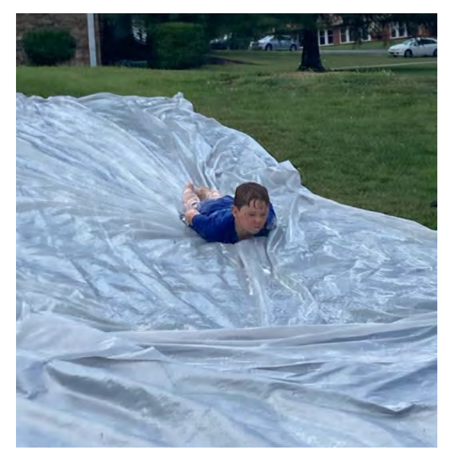
When he falls, he will not be hurled down, Because the Lord is the One who holds his hand. (Psalm 37:24)