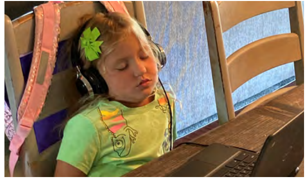
In peace I will both lie down and sleep, For You alone, O Lord, have me dwell in safety. (Psalm 4:8)