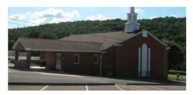
Orebank MBC in Kingsport

Our Foster Care team in Knoxville has been incredibly grateful to City View Baptist Church there for hosting them for the past few years. Expansion of the program and the size of the staff needed in the Knoxville area coincided with Wallace Memorial Baptist Church's offer for us to relocate to part of their property. Case Manager TJ Cloud describes their new home, "It's actually a house, three bedrooms and a bathroom, and extra storage. We have a functional kitchen and a living room that is set up with an extra desk set for other staff members to use when they visit the office." At five members, they are the largest off-campus group of TBCH employees, so this move required a lot of volunteer effort. "We truly appreciate everyone's hard work and effort in helping us create such a great office space."