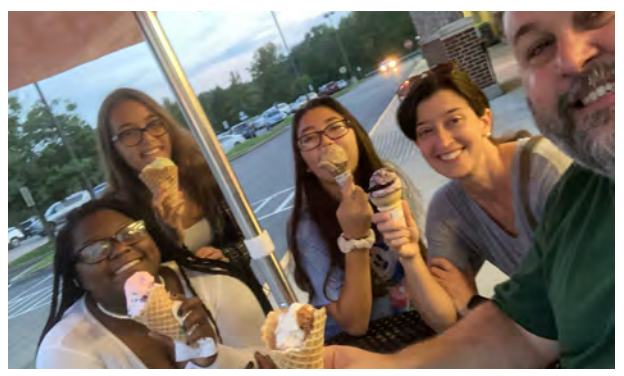
Taste and see that the Lord is good; How blessed is the man who takes refuge in Him! (Psalm 34:8)