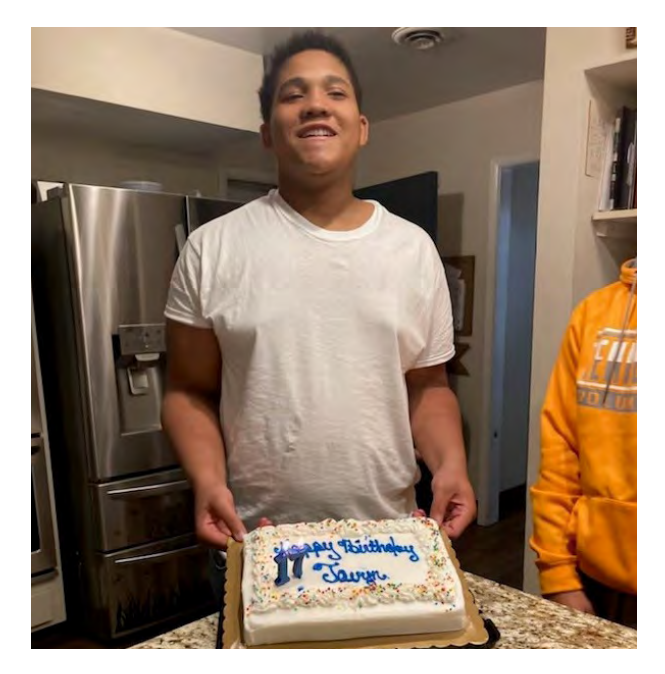
This is the day which the Lord has made; Let's rejoice and be glad in it. (Psalm 118:24)

A few ways the Lord has blessed the kids at TBCH